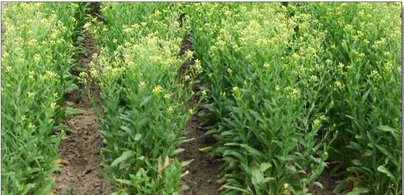
FIGURE 2. Camelina plants bloom with small, four petal, yellow flowers.

Concurrently camelina meal is being fed to 2 and 3 year-old beef cows to evaluate the potential to use the meal as a protein and energy source for breeding beef cattle. The objective of the trial is to determine if the beneficial effects seen in humans from consuming elevated levels of omega-3 also occur in beef cattle. If camelina meal can effectively be utilized for production of omega-3 enriched beef, beef will constitute the largest single market for camelina meal in Montana. For more information contact Darrin Boss, Northern Agricultural Research Center, Havre, Mont.