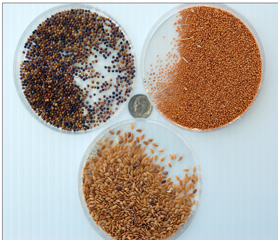
FIGURE 4. Camelina seed (upper right) is very small as compared to canola (upper left) and flax seed (bottom).

Seed characteristics of camelina are different than those of other oilseed crops. Camelina is a very small seed (see Figure 4), but it does not roll like canola or flow like flax. Filling cracks by taping or caulking truck beds and storage bins should be done prior to harvest to prevent seed loss. To date, there have been no reported observations of insect damage to seed occurring during bin storage. Currently no bin insecticide treatments are registered for use on camelina seed, so none should be used.